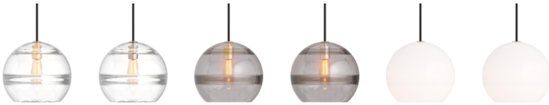
clear/ aged brass clear/ satin nickel smoke / aged brass smoke / satin nickel white / aged brass white / satin nickel